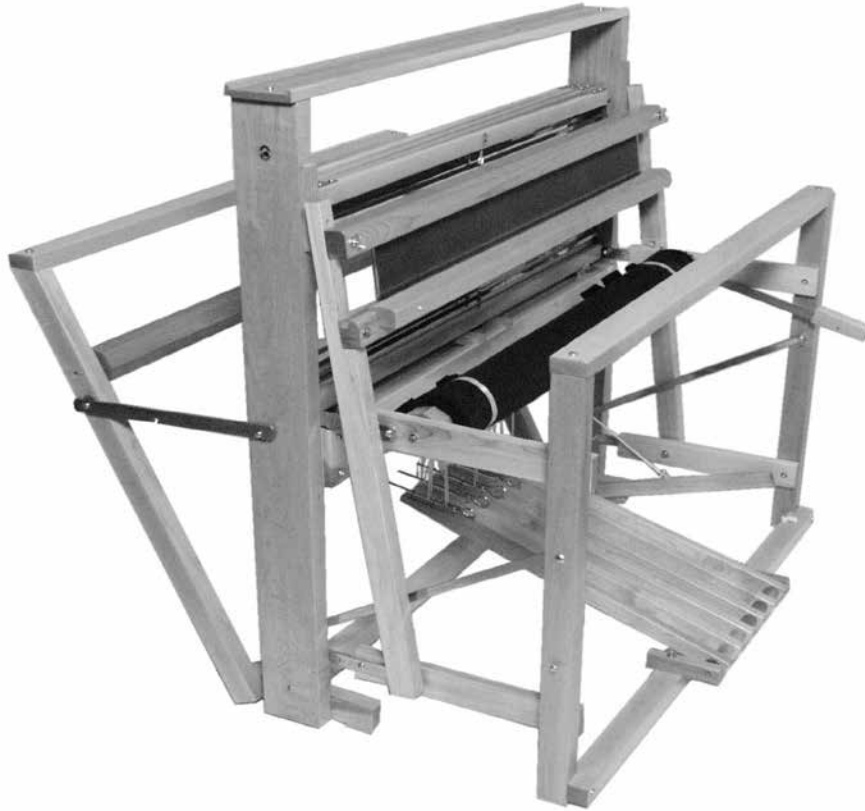
Jack-Type 4 Shaft

1009-0000 Jack-Type 4 Shaft Loom $2323.00 1009-0008 Jack-Type 8 Shaft Loom $3289.00