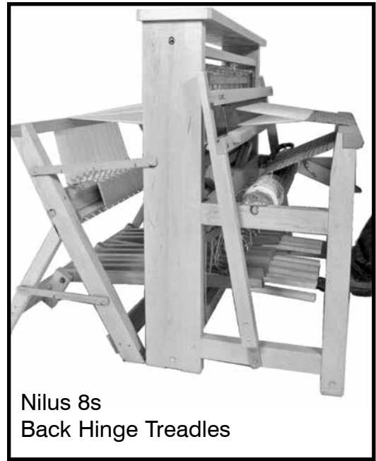
Nilus 8s Back Hinge Treadles