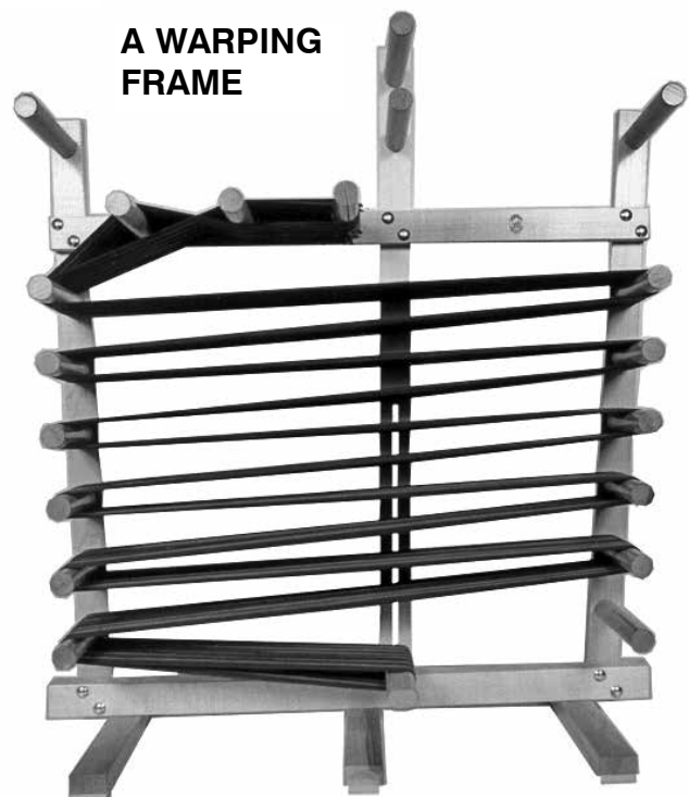
A WARPING FRAME

A floor standing INKLE Loom, to weave strips of fabric up to 6" wide and 16 feet long. Designed for continuous string heddles which are made in minutes. The heddle length is adjustable by turning the heddle carrier.